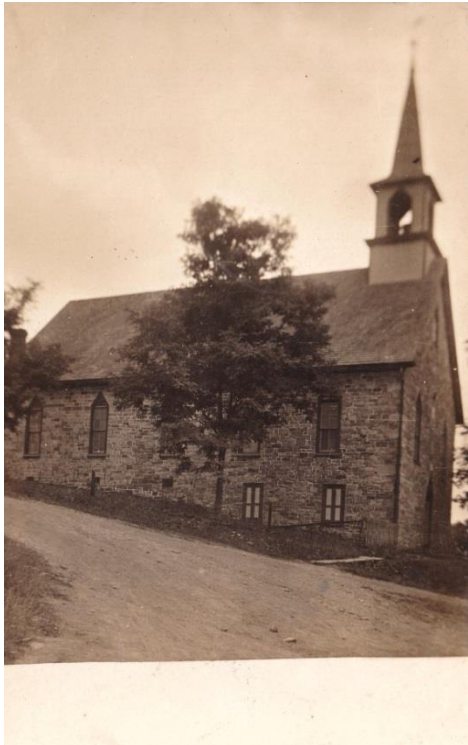
Photo #1: The old stone Paradise United Brethren Church in Hopeland was built in 1847. The postcard shown is the most common of the early real photo views of this church.

The congregation began meeting in the public school building, and immediately started work on reconstruction. The cornerstone for the new church building was laid in May, and dedication services were held in November. Almost everything was new. Even the church name. In October, at the session of the annual U. B. conference at Sunbury, the “Paradise United Brethren Church” was officially renamed the “Hopeland United Brethren Church”.