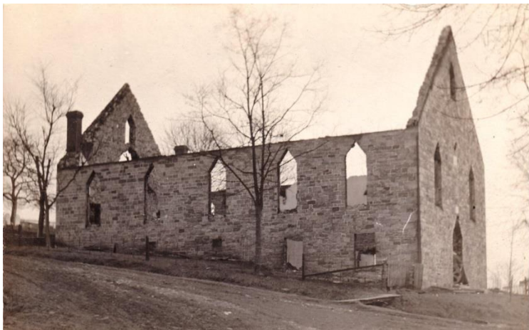
Photo #3: This real photo postcard shows the aftermath of the conflagration. The church interior was gutted because the fire spread very rapidly. There was only enough time to save the organ, some carpet, pulpit furniture, and the pulpit Bible.