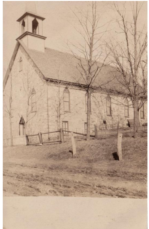
Photo #2: The original church was remodeled in 1889, and the exterior remained unchanged until lightning struck on March 7, 1910. This RPPC view, taken before the fire, is scarcer than the other.