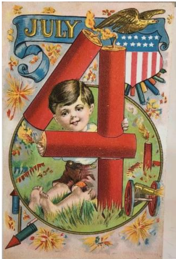
First: Betty Beck "July 4th"