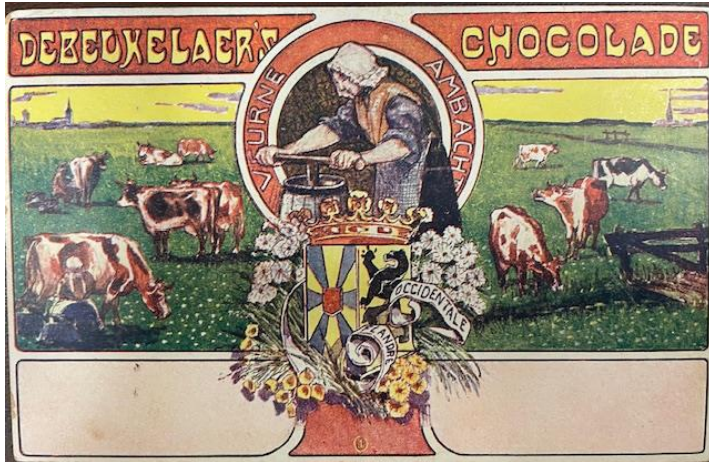
First: Pam Tronsor "Chocolate"