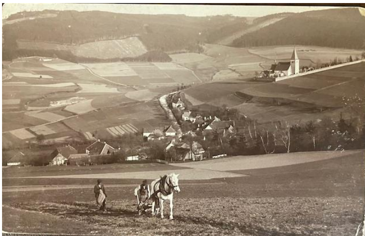
Third: Gisela Withers "It Must Be For Spring"