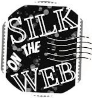
Silk on the Web