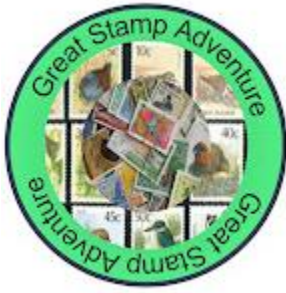
Great Stamp Adventure

One of the many topics of conversation we had at the dinner was Internet service, and that led to how we currently consume “television”. Most of the “television” I watch is on YouTube, and I follow several fine content creators who focus on making videos about stamps. Here is a short list of some of the creators that I follow. (All page statistics are as of 12/18/2024).