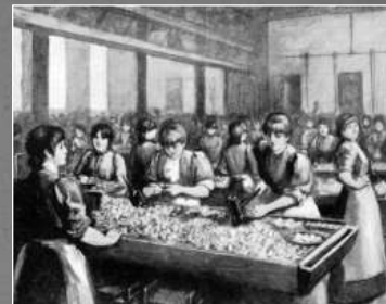
Packing Girls on Match Factory Floor