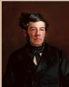
Figure 7. Portrait of George Cadwalader, by Thomas Eakins.