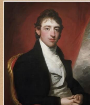
Figure 10. Portrait of David Montagu Erskine by Gilbert Stuart 1802.

Pa Postal Historian, Feb. 2024, Whole No. 237, Vol. 52, No. 1, pp. 5-9