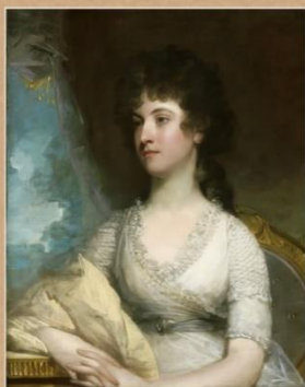
Figure 5. Portrait of The Lady Erskine, by Gilbert Stuart, Philadelphia Museum of Art.