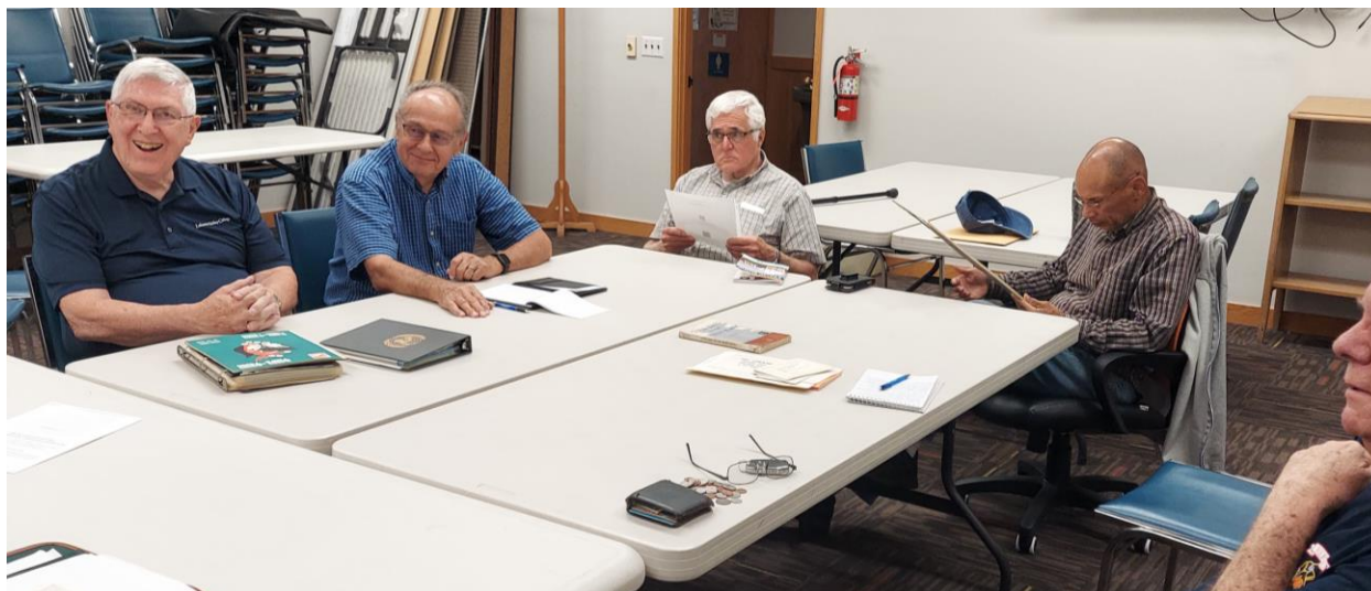
Members and our guest had another great time at the LSCC meeting in August.