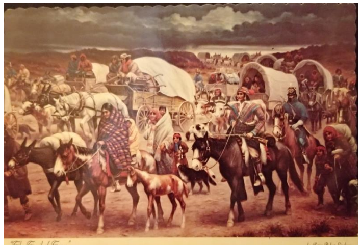
Second: Gisela Withers “Trail of Tears”