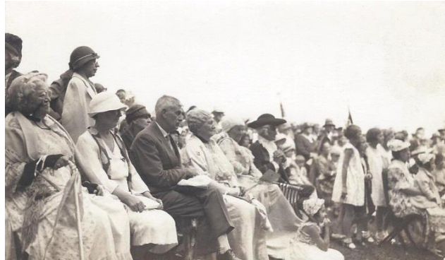
Photo of the spectators on part of Main Street that were more than four rows deep.

Although not everyone in Churchtown participated in the parade, many supported the event by dressing in colonial clothing.