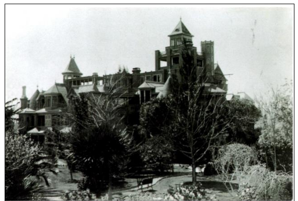
Vintage photo, circa 1890