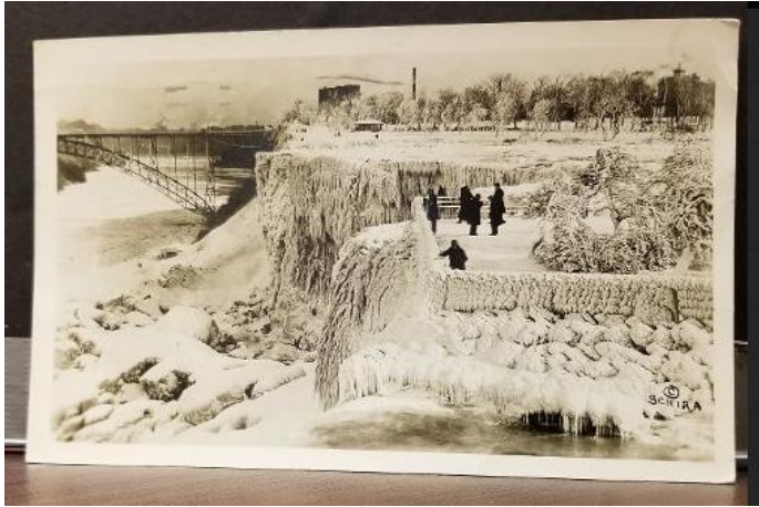
First: Dick Pendergrast – “Niagara in Winter”