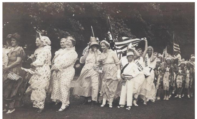
Lining up at the start of the 1932 parade in Churchtown.