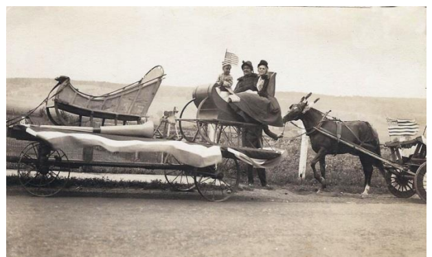
Local float with early sleighs and a rocking horse.