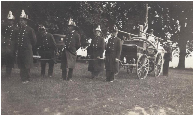
One of the few parade participants that weren't dressed in colonial garb was this group of men portraying a 19 th century fire company.