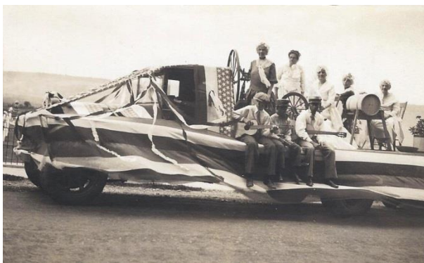
Local float with homemakers and musicians.