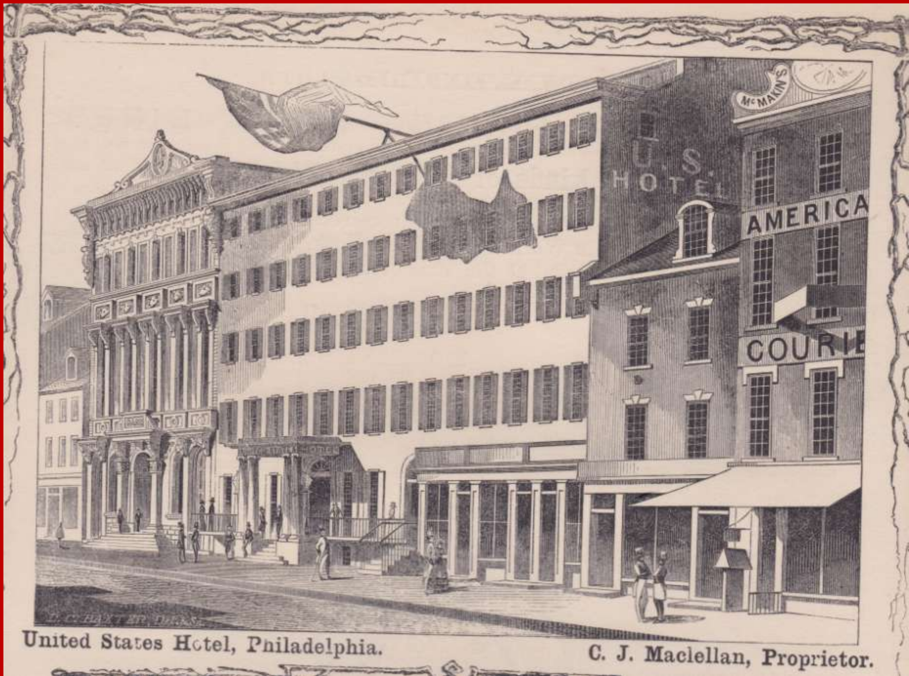
United States Hotel, Philadelphia.