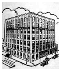
H.E. Harris & Co. Page-4