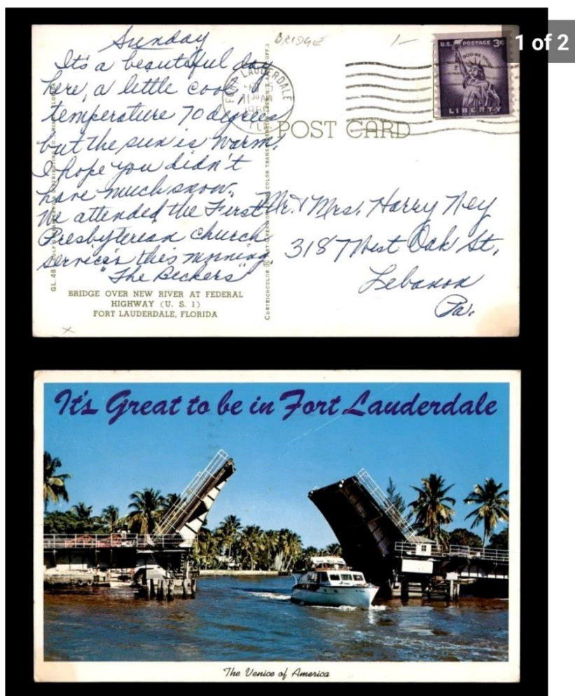
Mayfairstamps US 1960 Florida Ft Lauderdale to Lebanon PA Bridge River Postcard