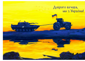
A Ukrainian Solidarity PPC-See Pg. 4