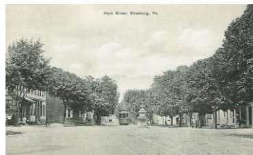
Strasburg postcard from 1911 showing a trolley and the fountain in the square.