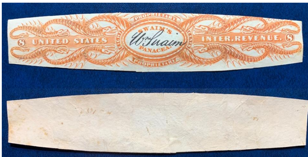
RS235d Wm. Swaim 8¢ orange, die cut Final Restored Stamp/Label, Face and Reverse