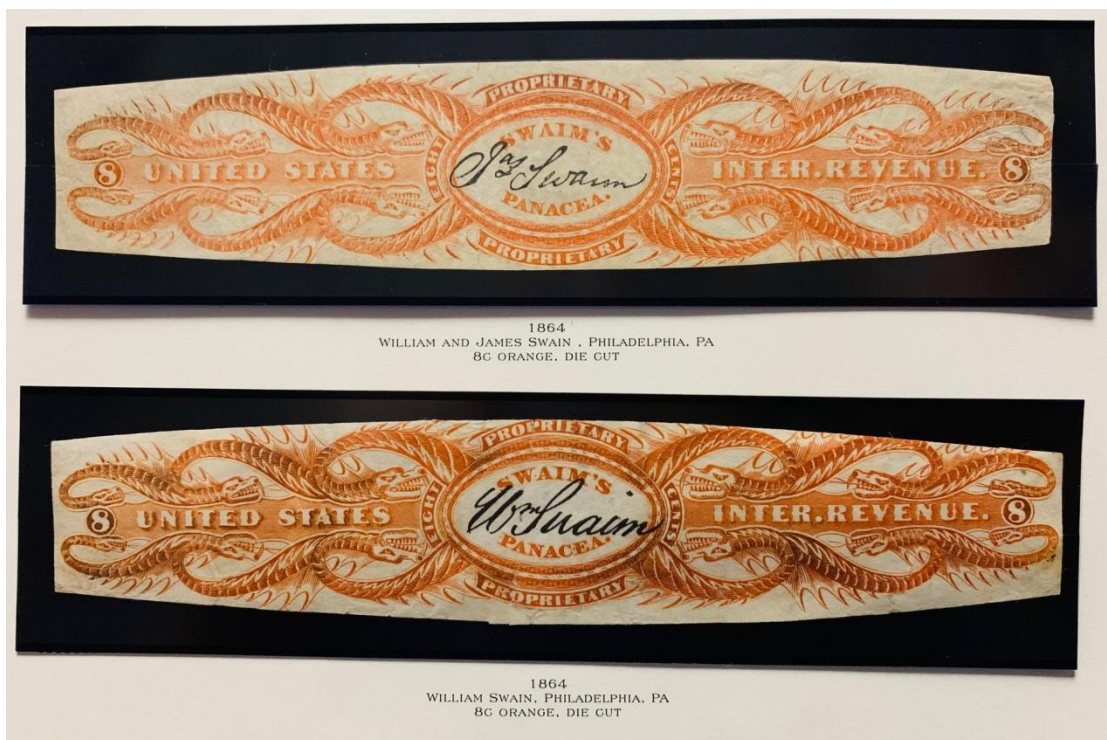
Top: RS234 Jas. Swaim 8¢ orange, die cut. Bottom: RS235d Wm. Swaim 8¢ orange, die cut

My most recent restoration project involving surface cleaning, crease smoothing and reinforcement/tear repairs (with acid-free, archival materials). My approach is to best preserve the integrity and value and is reversible.