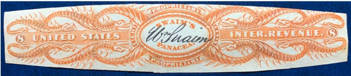
3 Phases of Restoration - Front