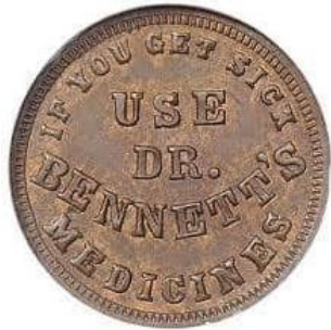
Civil War Token