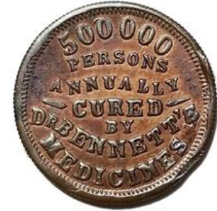
Civil War Token