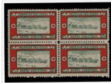
1913 type 2