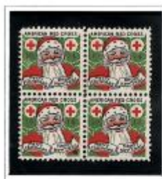
Scott no. WX 15