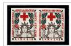
Imperforate Pair, Type 1

Essay, no longer listed in the Scott catalog, it was formerly listed as WX 23