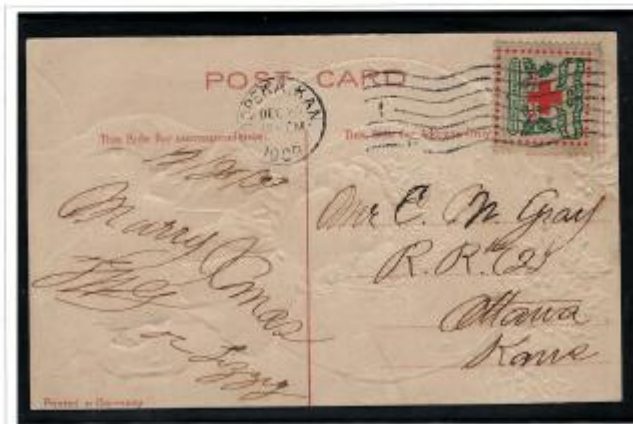
1909 Christmas Seal illegally used as postage.