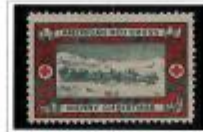
Type 1 (Scott no. WX 11)