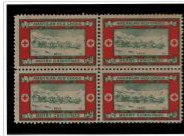
1913 Type 3