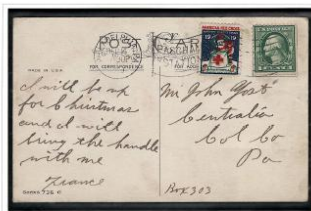
Below: 1919 type 2 seal tied to a Christmas card