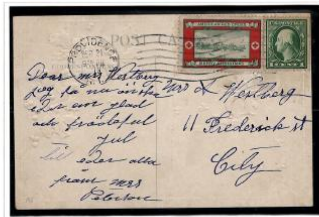
A pair of 1913 type 3 seals tied to christmas cards