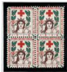
1918, type 3

Essay, no longer listed in the Scott catalog, it was formerly listed as WX 23