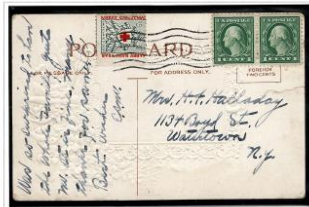
1917 Christmas Seal tied to a card.