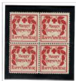
1907, Type 2 WX 2

1907 type 2 Christmas seal tied to a New Years card. Very rare usage. This is the key to any tied seal collection. Only a few are known to exist.