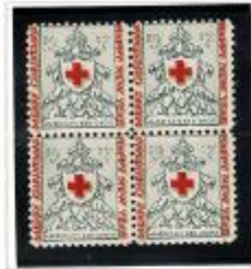
WX 19 Perf 12