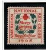
Type 1A perf 14, WX3