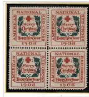
Type 2, perf 12