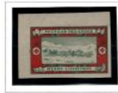
1913 type 1 Essay