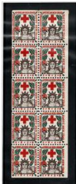
WX 21d Booklet Pane