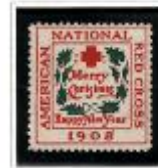
Type 1A perf 12, WX 3a