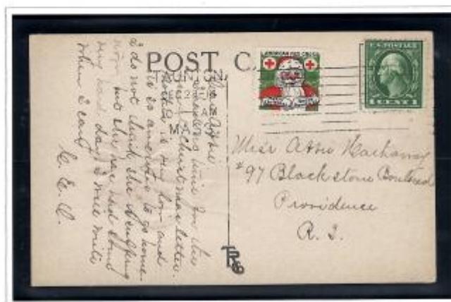
Christmas card with 1914 seal tied to it.