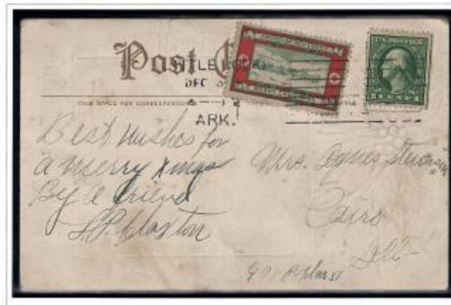
A 1913 type 3 seal tied to a christmas card