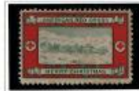
Type 2 (Scott no. WX 12)