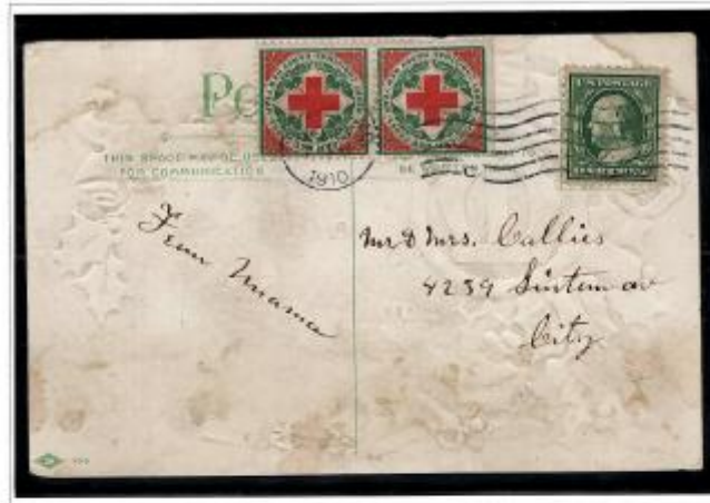
1910 Christmas Seals tied to cards