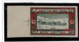
Type 1 Essay