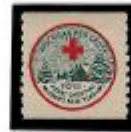
Type 3 Scott no. WX 9