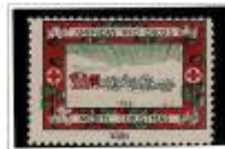
Scott no. WX 14 No longer listed by Scott, this is a local issued by the Chicago Tuberculosis Institute