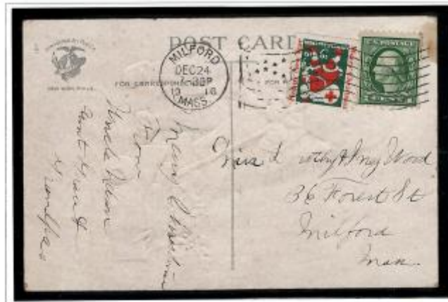
1916 Christmas Seals tied to greeting cards.