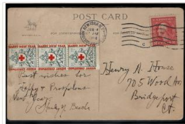
1917 Christmas Seals tied to a New Year's card.