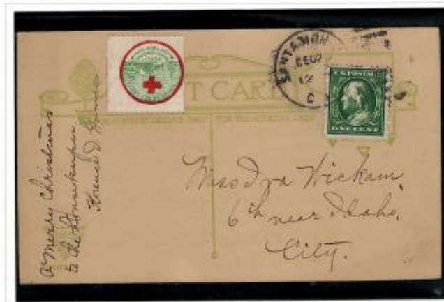
1911 Type 4

The 1911 Type 4 Christmas Seal is unlisted by Scott. It was privately prepared in California and is arguably the rarest of all Christmas Seal varieties with only 30-40 copies known to exist.