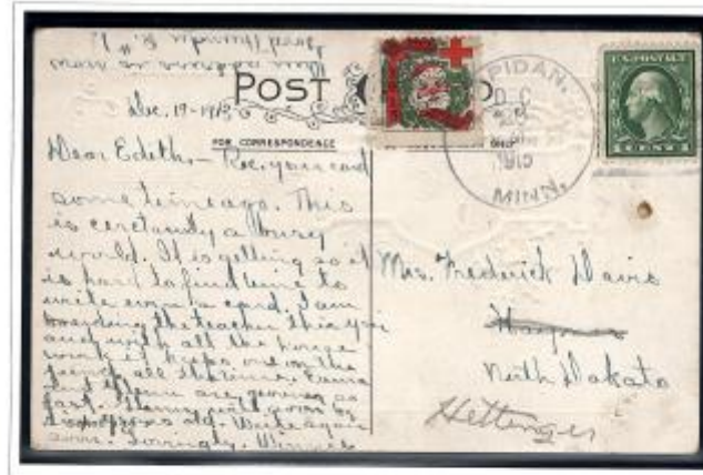
1915 Christmas Seals tied to cards