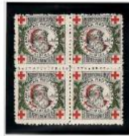
Scott No. WX 10