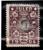
Denmark no. 1 The First Christmas Seal

Christmas seals originated in Denmark in 1904 (the first Danish seal is shown below). They were first introduced in this country by Emily P. Bissel in 1907. The limited circulation of these seals is responsible for the great rarity of legitimately used examples. Legitimate usage was almost exclusively limited to the Delaware and Eastern Pennsylvania areas. Only $3000 was raised from the sale of 1907 seals to fight tuberculosis. However, this modest success was quickly followed by a national campaign in 1908. The use of multiple printers and processes in 1908 has lead to a number of interesting and scarce varieties. 1908 is regarded as a collecting interest in itself.