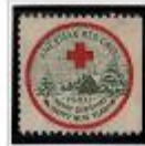
Type 1 Scott no. WX 7