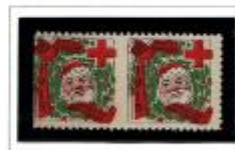
Error, Imperforate vertically

Both blocks are perf 12 1/2 The block on the right has a distinctly darker shade of red.