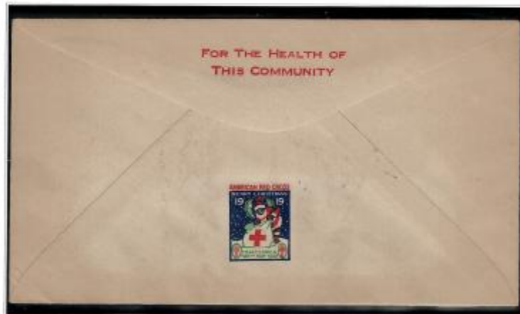
1919 type 1 experimental envelope