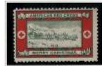
Type 3 (Scott no. WX 13)