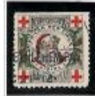
1912 Christmas Seal with Bethlehem, PA cancel