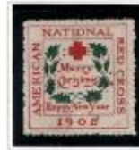
Type 1B Unlisted in the Scott Catalog