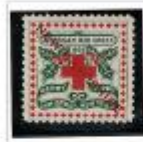
WX 5a New Hampshire Local