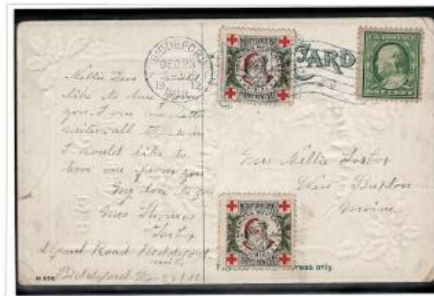
Christmas card with two 1912 seals