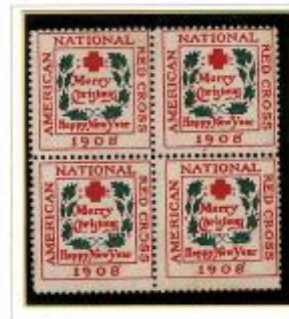
Type 1A, perf 12