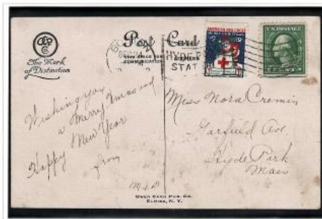
Above: 1919 type 1 seal tied to a Christmas card