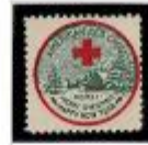
Type 2 Scott no. WX 8