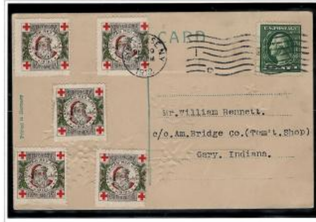
1912 Christmas Seals tied to cards