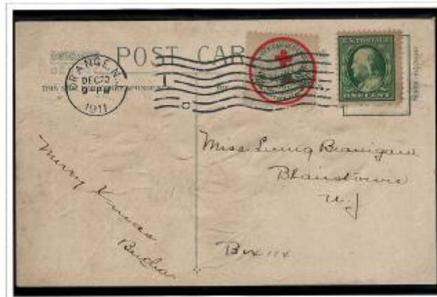
1911 Type 1 Christmas Seals tied to cards.