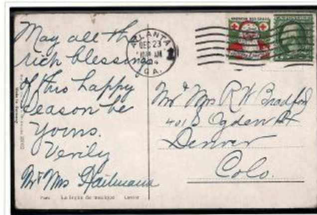
1914 Christmas Seals tied to cards