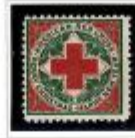
Scott no. WX 6