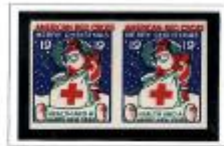
Type 2 Imperforate Pair