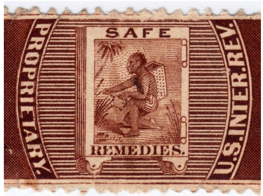
#RS258dt: double transfer of central vignette.

The design shift (west and south) is seen in the center left of the vignette. It is most prominent in PROPRIETARY, the horizontal lines, all the letters of REMEDIES, the palm tree, the left and right hands, the lower left herbs near the ground and the left wheels and outer frame line of the safe.