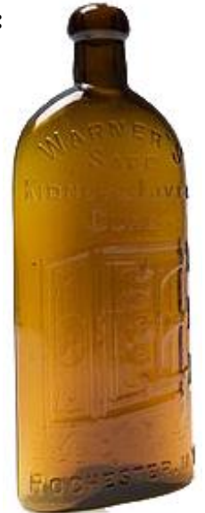
Warner's Safe Kidney & Liver Cure, Rochester NY