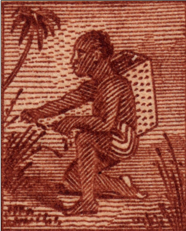
Normal transfer of central vignette.