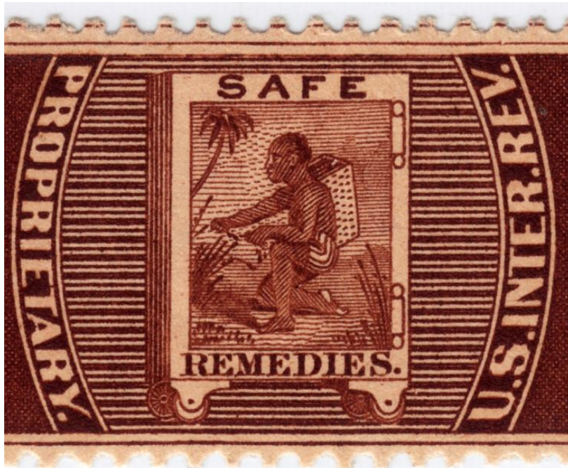
#RS258d: normal transfer of central vignette