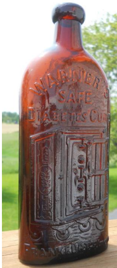
Warner's Safe Diabetes Cure, Rochester NY