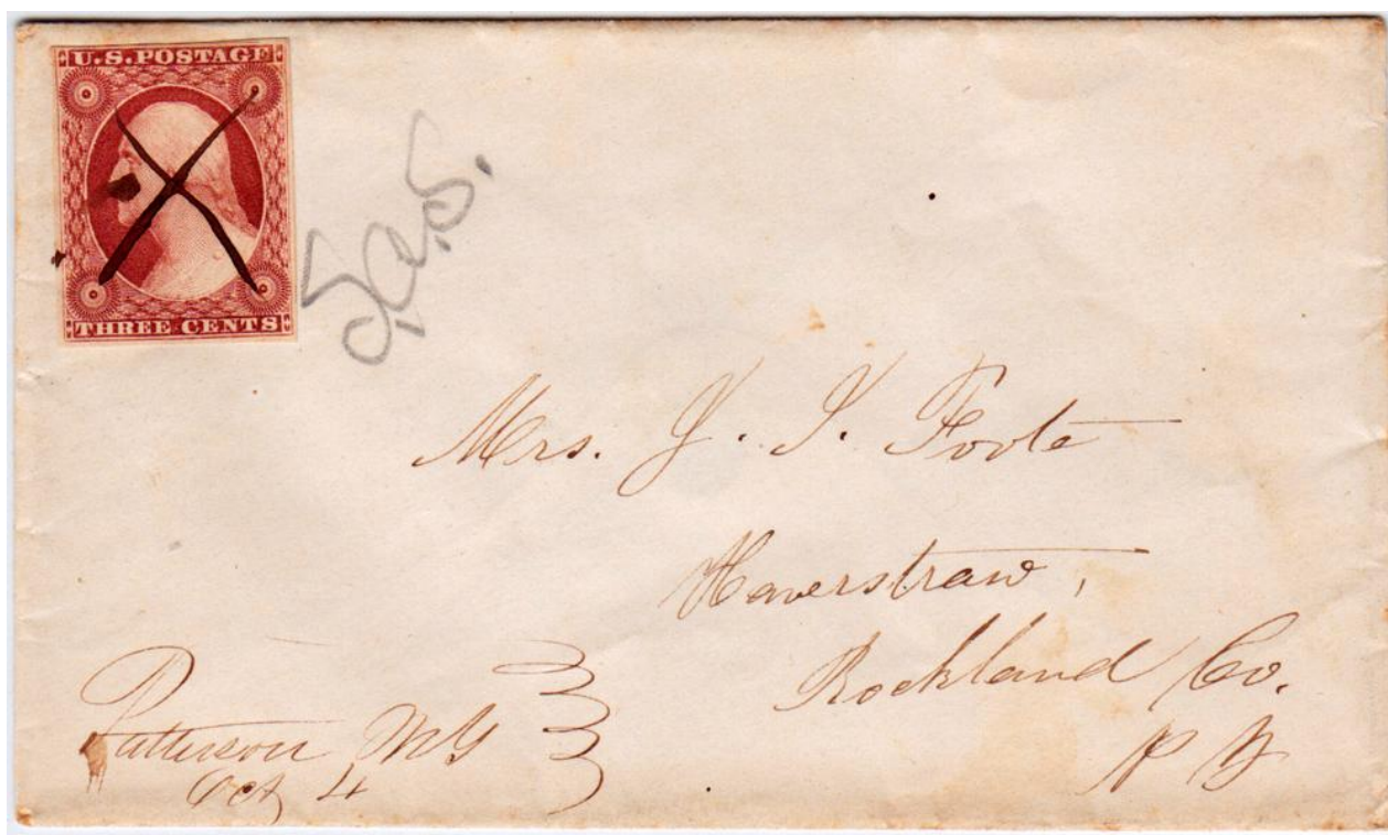
Figure 1. Ladies cover, Patterson, New York dated 4 Oct (1851) to Haverstraw, New York with new plate flaw variety on Scott #10A, position 97 from the right pane of Plate 1 intermediate (97R1i).

I noted this variety while examining the small Ladies cover illustrated in Figure 1, a recent acquisition for my research studies on Dutchess and Putnam Counties in New York State. The stamp is a single imperforate Scott #10A in a reddish orange brown shade, tied by a manuscript line, cancelled with an “X” and mailed from Patterson, NY in Putnam County (in all probability in 1851). The postmaster at the time was Hervey Crosby and he most likely marked in pen at lower left the two-line “Patterson NY Oct 4” postmark. The cover is addressed to “Mrs. G.J. Foote, Haverstraw, Rockland Co. N.Y.”. There are no contents, or notations on the reverse.