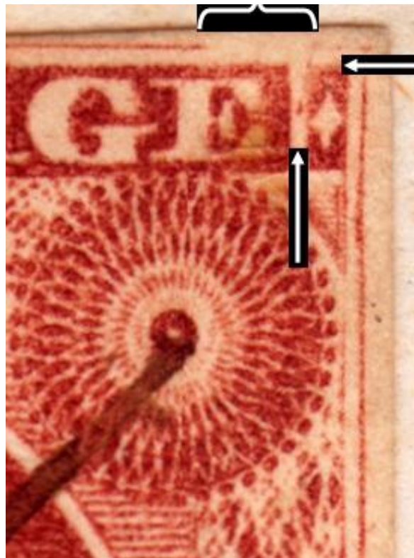
Figure 3. Blow-up of the upper right quadrant of the 97R1i illustrating the large “Dot and Ink Trail” between the top label and the URDB (white arrows). Note the gap or absence of ink missing from the outer frame line above the “E” of “POSTAGE” eastward to the URDB (white bracket).

As with any new discovery, one wants to confirm that extra “dots”, “dashes”, and/or “lines” are constant plating marks, and not merely stray ink unique to that particular stamp. It was at this juncture that I contacted via email my stamp and postal history colleagues from the U.S. Classics Study Group and shared a 1200 dpi digital scan of my copy requesting more information – had anyone come across this variety before and could they check their holdings for examples of 97R1i. As it would have it, camaraderie is alive as my outreach paid off.