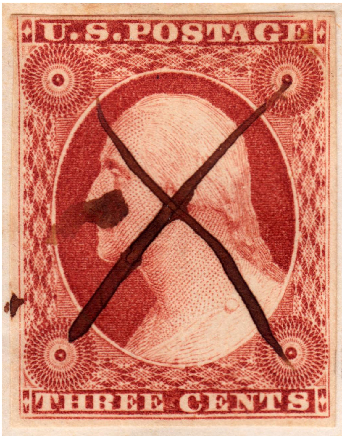
Figure 2. An enlarged image of the 97R1i stamp from the Patterson, New York Ladies cover clearly showing the previously unlisted “Dot and Ink Trail” plate flaw variety at upper right.

Figure 2 illustrates the discovery copy in which the plate flaw can be seen at the upper right. Figure 3 is a blow-up of that quadrant, allowing us to further dissect what I shall term the 97R1i “Dot and Ink Trail” variety.