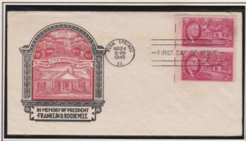
F.D.R. and Little White House - 2¢ Carmine Rose Issue date August 24, 1945. This stamp commemorates the time President Roosevelt spent at the Little White House in Warm Springs, Georgia. As therapy following an attack of polio, Franklin Roosevelt swam in the warm mineral pools of Warm Springs, Georgia.