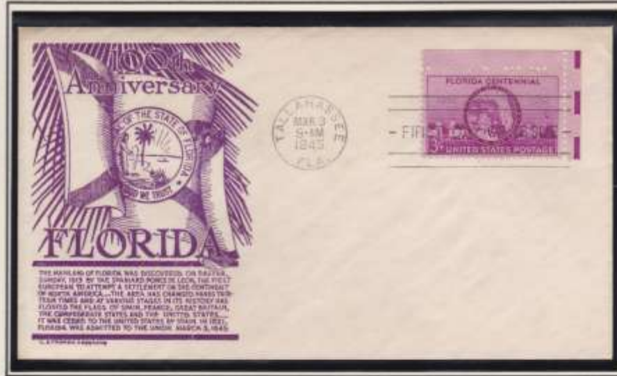
Florida Centennial - 3¢ Bright Red Violet issue date March 3, 1945. The Florida Centennial issue, pictures the state seal, the Gates of St. Augustine, and the capitol at Tallahassee.