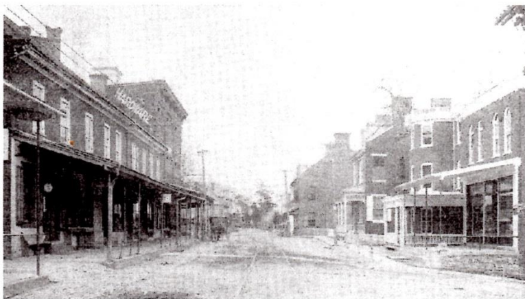
MAIN STREET,—East from Luther Ave., New Holland, Pa.