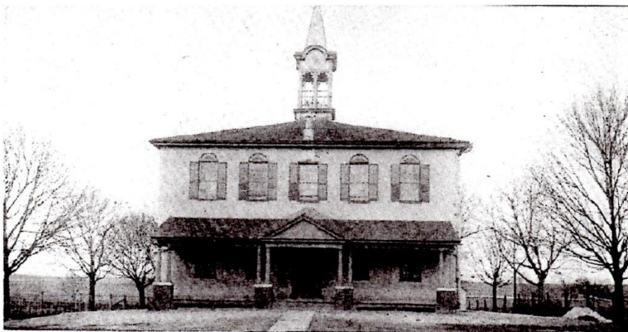
NEW HOLLAND, PA.—Public School Building.

The location label of some later printings on postcards in this set starts with "NEW HOLLAND, PA.". There are hand colored examples occasionally seen of postcards in this set.