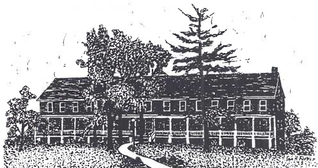
Old Lancaster County Hospital

RECORDED ON The National Historical Register