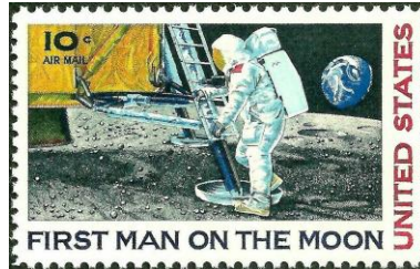
Scott C76 issued September 9 th 1969 – First Man on the Moon

This may be the August Issue but July 20 a significant date that I could not let pass. I was 16 years old at the time and was fortunate to be here in the United States staying with my cousins on Long Island. I was so exciting to be here and watch events unfold (in black and white). Below is a little philatelic time line of this momentous achievement.