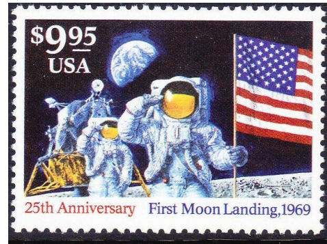
Scott 2841 /42 Issued July 20 th 1994: 25 th Anniversary Issue