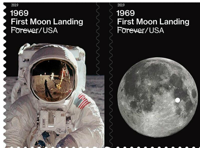
Issued July 20 th 2019: 50 th Anniversary Issue

Editors Note: In the first 25 years the cost of a stamp increased 19 cents, In the second 25 years the increase was 26 cents