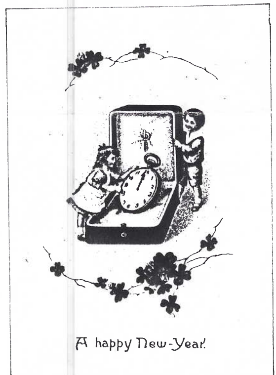
Printed in Germany for F.W.Woolworth, Series 444/5.