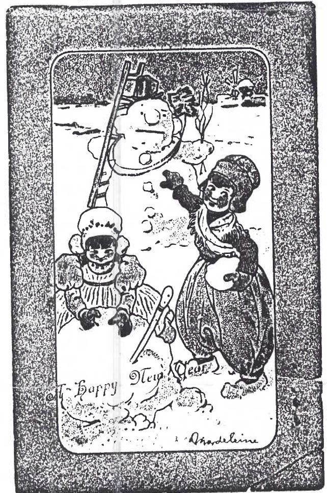
Unknown publ. (Depose Nr. 2199). Used 1906

Housewives made certain their chimneys were cleaned at the beginning of the New Year and had the sweeps clean their slate roofs at the same time. They wanted to start the New Year with a clean slate.