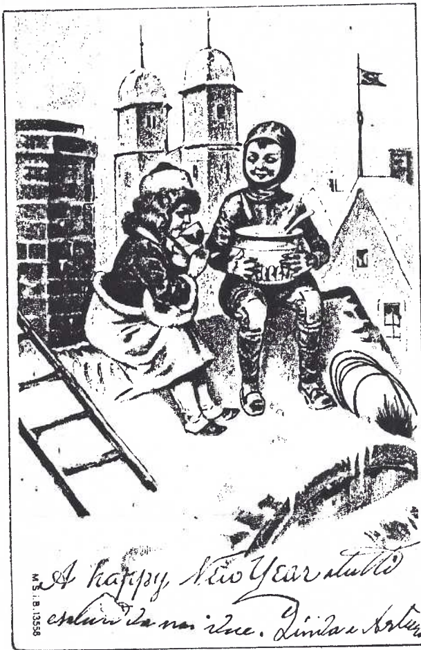
Unknown foreign publisher - M.S.i.B. #13558 ("E" on sailing ship w/beacon light). 1907

Earlier chimneys were large and men using their elbows and knees could climb up in them. Later, as chimneys got smaller, the sweeps apprenticed small boys for the cleaning. Little girls were even used to clean chimneys as small as 6"x14"! The children were often foundlings or discards from families that couldn't afford to rear them.