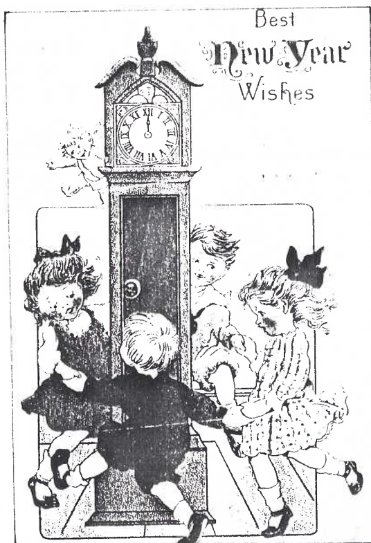
Publ. by Stecher, series 56C. Used 1914.