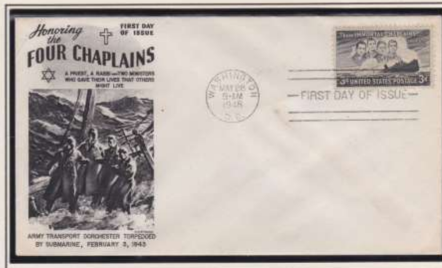
Four Chaplain Brothers - 3¢ Gray Black issue date May 28, 1948. Honors the Four Chaplains Brothers who sacrificed their lives in the sinking of the S.S. Dorchester, February 3, 1943 during World War II.