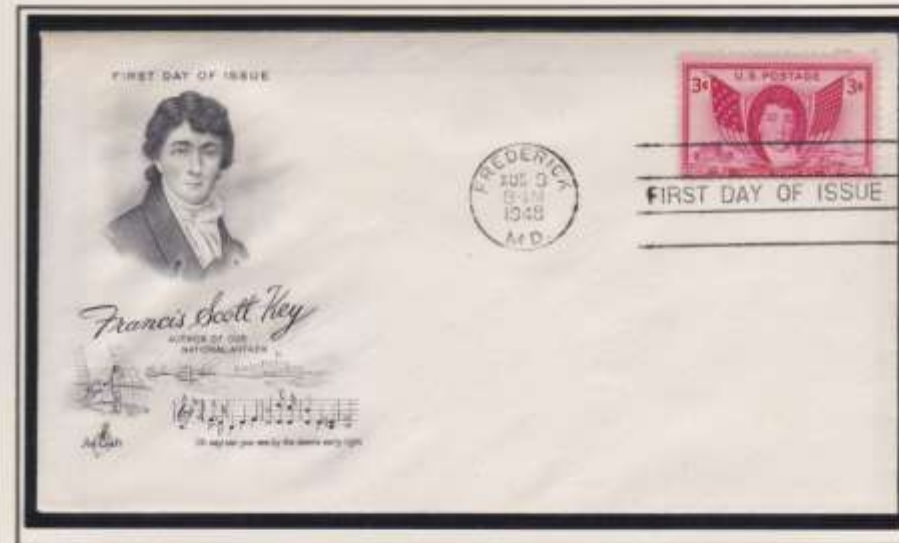
Francis Scott Key - 3c Rose Pink, issued date August 9, 1948. This stamp honors "Star Spangled Banner" author Francis Scott Key. The stamp features a portrait of Key, American flags from 1814 and 1948, his family home, and Fort McHenry.