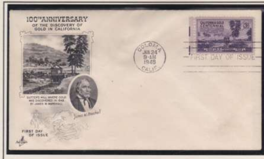
California Gold Rush Centennial - 3c Dark Violet issue date January 24, 1948. This stamp pictures Sutter's Mill in Coloma, California and commemorates the 100 th anniversary of the discovery of gold there.