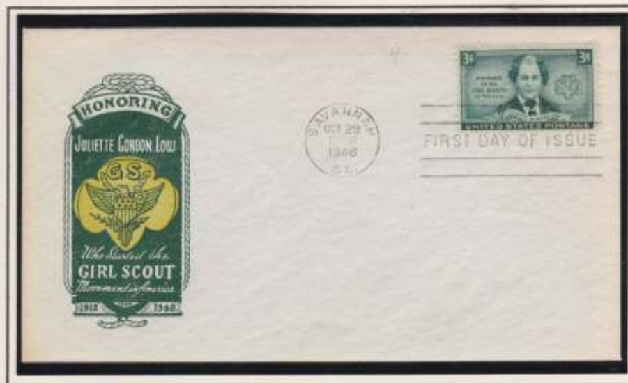
Juliette Gordon Low - 3c Blue Green issue date October 29, 1948. This stamp honors Juliette Gordon Low, the founder of the Girl Guides, which later became the Girl Scouts of America. Low is pictured along with the Girl Scouts emblem.