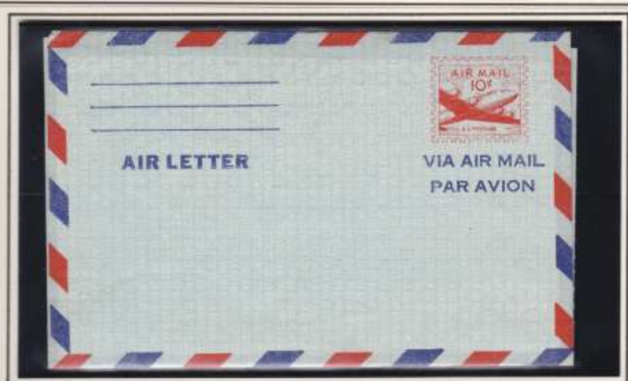
DC-4 Skymaster - 10c Air Letter. This Postal Stationery Envelope with the DC-4 Skymaster stamp embossed on the envelope was issued in Washington D.C. on April 29, 1947.