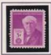
Thomas A. Edison - 3c Bright red violet, issue date February 11, 1947.

This issue celebrates the 100 th anniversary of the birth of Thomas A. Edison (1847-1947), inventor of the incandescent lamp, phonograph and over 1200 other inventions. Edison was known as the "Wizard of Menlo Park".