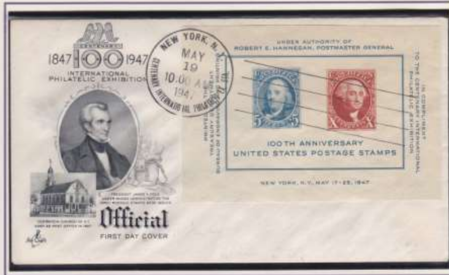
Imperforate Souvenir Sheet - 5¢ and 10¢ issue date May 19, 1947. Commemorates the 100 th anniversary of the first U.S. Postage Stamps.