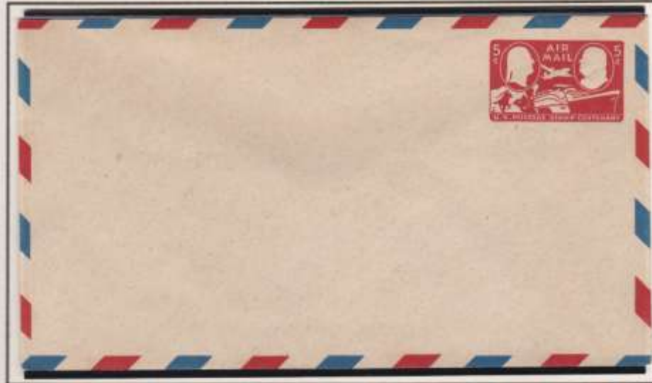
Washington & Franklin Mail-Carrying Vehicles Postal Stationary Envelope - 5c Carmine issue date May 21, 1947 in Washington D.C.