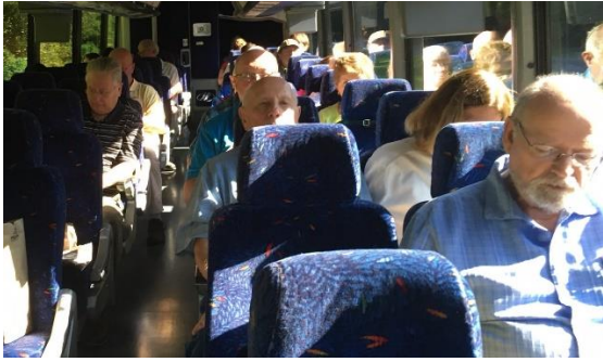
The Journey down to Washington