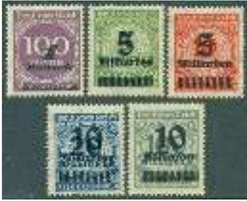
Above: Examples of German inflationary stamps with overprints.

In late 1923, the German economy was ravaged by hyper-inflation.