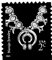
New 2 cent stamp

Stamp Show —Philadelphia Weekday Monday Stamp Show, 10 am-9 pm, January 16, Radison Hotel Philadelphia Northeast, 2400 Old Lincoln Highway, Trevose, PA, 1-800-701-7091.