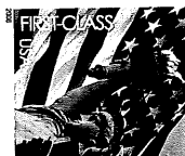
New 39 cent stamp