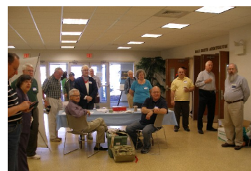
Spectators at the 75th Celebration