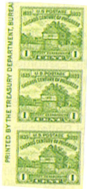
James A. Farley left the Roosevelt administration due to his differences with the President's decision to run for a third term!

FDR opened the 1939 NY World's Fair with a rousing speech for world peace and cooperation in the "Age of Tomorrow."